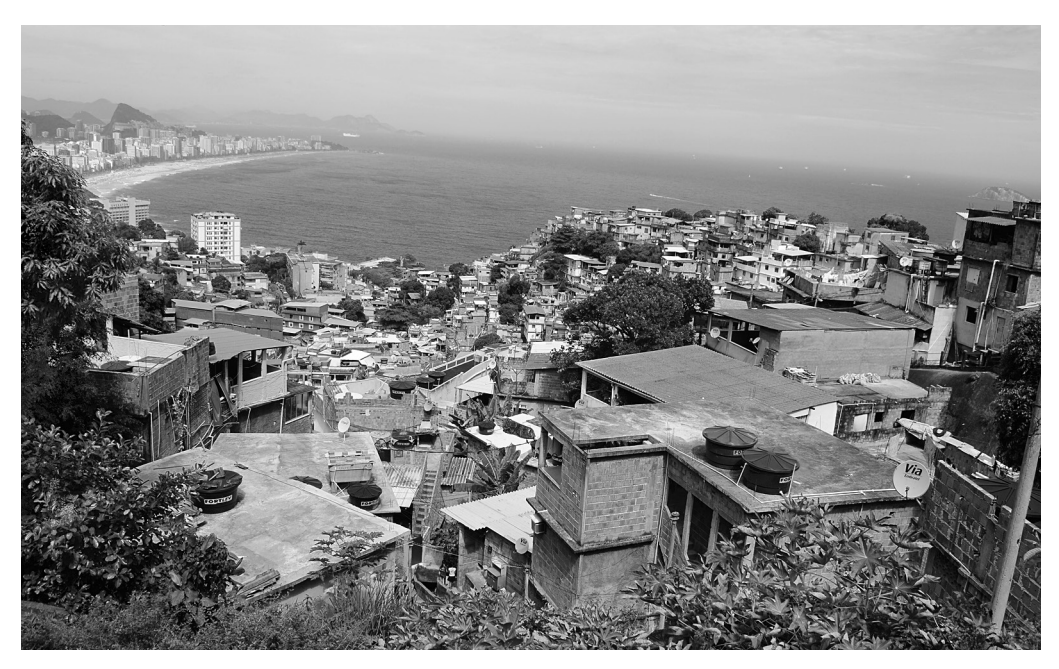
Fig. 12.3. Vidigal favela, Rio's most notably gentrifying favela. FELIPE PAIVA

In a handful of other favelas, the government gave out land titles and invested in policing to bring down crime rates. It also invested in formalizing public services (water, electricity) and community businesses. Community moto-taxi stands and other informally operated businesses now had to be registered, with associated fees and taxes paid up. That was also the case of access to critical utilities. Not coincidentally, this happened in favelas located in the city's touristy South Zone where land values are highest, and where eviction is the most politically difficult. These communities consequently experienced the beginning processes of gentrification, with the cost of living increasing, property values