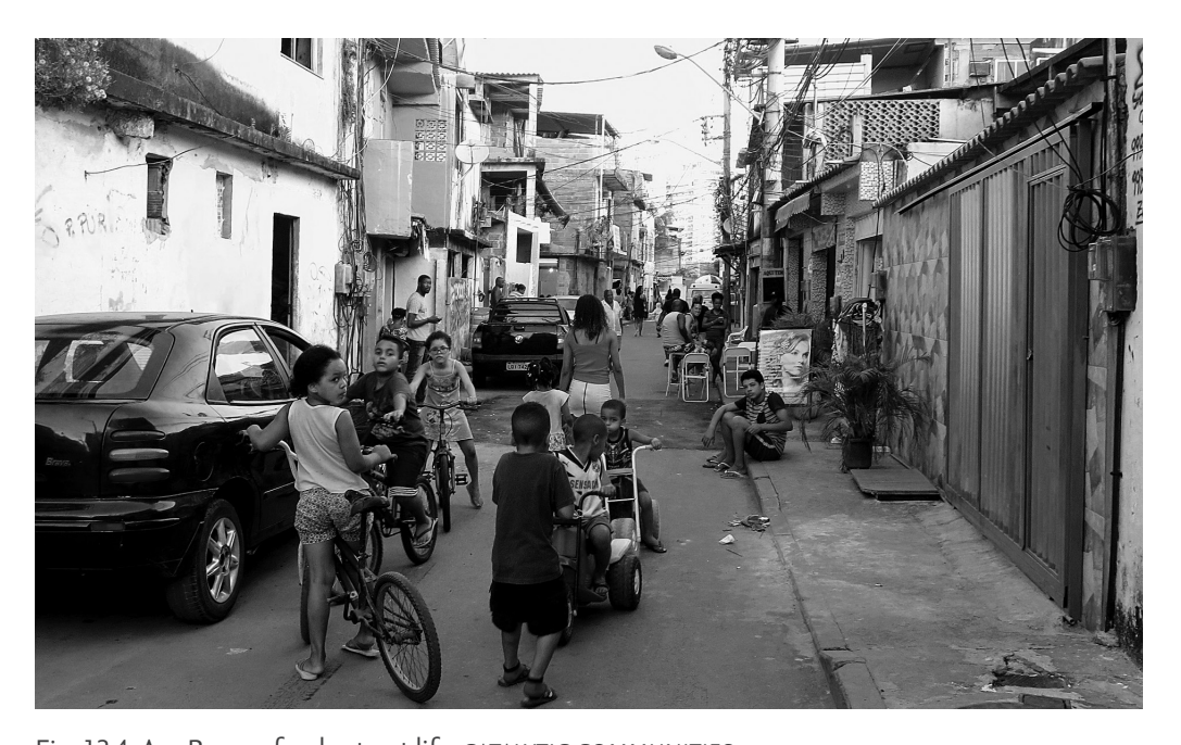
Fig. 12.4. Asa Branca favela street life.

After ten years of work supporting hundreds of favela community organizers and then helping their communities to fight both government-sponsored evictions and market-led gentrification — one due to the absence of land titles and the other to their presence — Catalytic Communities (CatComm), a Rio de Janeiro-based nonprofit organization, began studying the potential of CLTs for Rio de Janeiro's favelas. In the early 2010s, the organization engaged with a number of academic and business partners who were familiar with the CLT model in the United States, theorizing and imagining its possible application to favelas. CLTs seemed to offer a solution that would support the residents of consolidated favelas in achieving their primary land security objective: permanence , the ability to stay put in neighborhoods where they are financially and emotionally invested, places where they feel a sense of belonging.