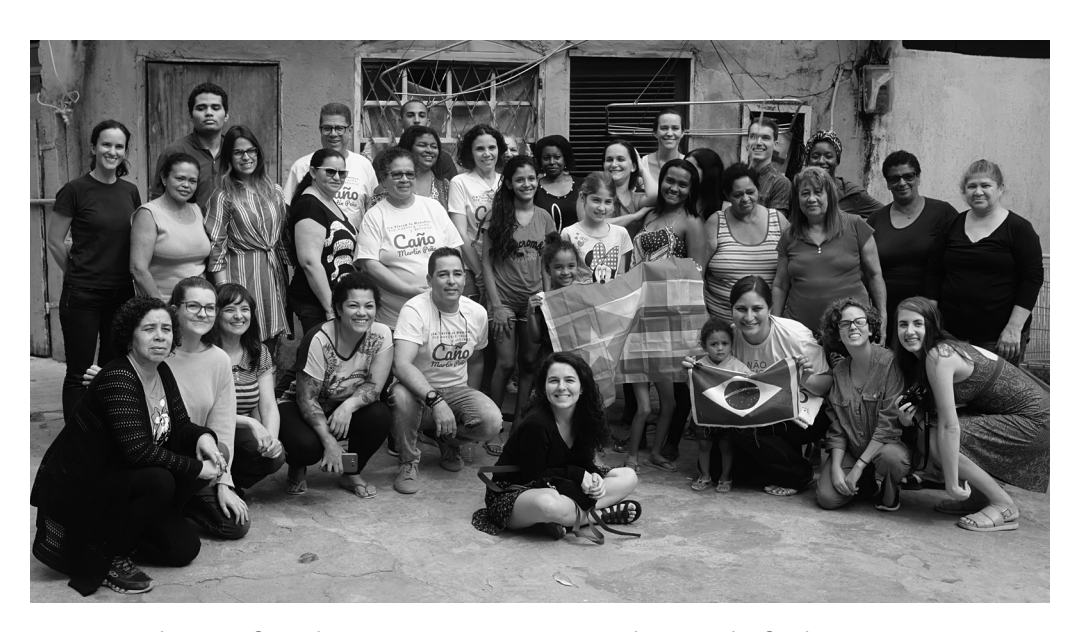
Fig. 12.5. Delegation from the Caño Martín Peña visiting the Barrinha favela, August 2018.

It should be noted that every community is different and, therefore, every CLT will also be different. There is no universal recipe as to how to create one. Community residents design the bylaws, policies, priorities, and internal procedures, which will define the CLT and will be different for every new CLT in accordance with the community's particularities, circumstances, and needs. It is worth repeating, as well, that a CLT that is designed to address the challenges of regularizing land tenure in informal settlements will be organized and operated differently from a CLT freshly created to provide new housing in neighborhoods where ownership of the land is already formal(ized). Our recommendations are aimed, in fact, at neighborhoods like Brazil's favelas where people have